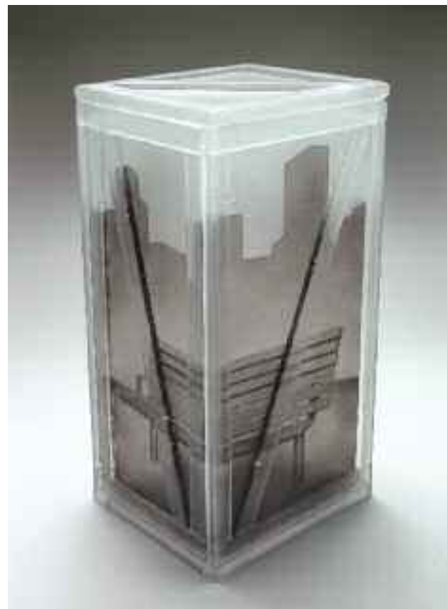
'A Place to Rest', 2010 (from the 'Crate Series'), kiln-formed and assembled glass, 38 x 20.5 x 17.5 cm