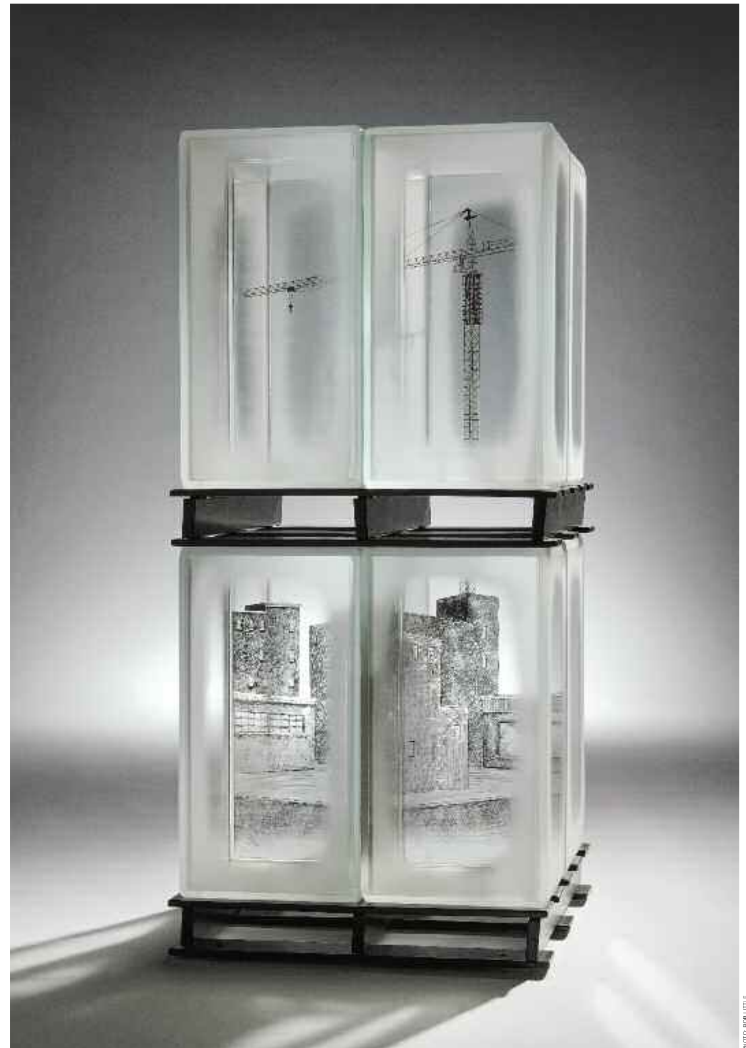
'Two Deliver Tomorrow', 2011 (from 'Shipment Series'), kilnformed and assembled glass with fabricated steel, 65.2 x 30.5 x 30.5 cm