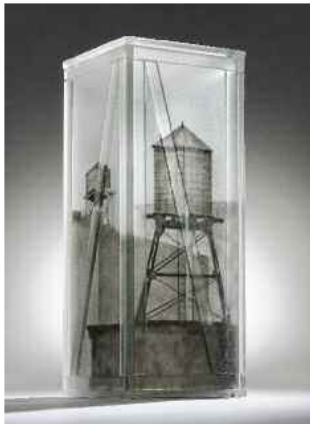
'Some Reserves', 2011 (from the 'Crate Series'), kiln-formed and assembled glass, 50.8 x 19 x 19 cm