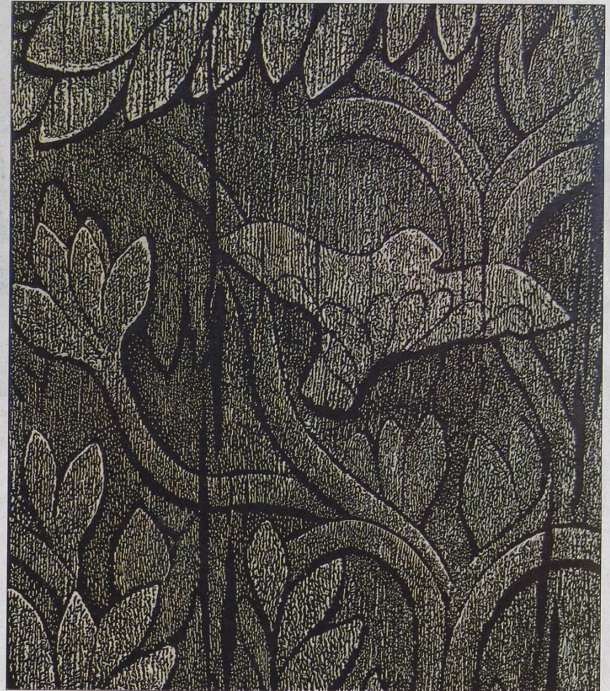
Ingrained - Flying at dusk 3 .