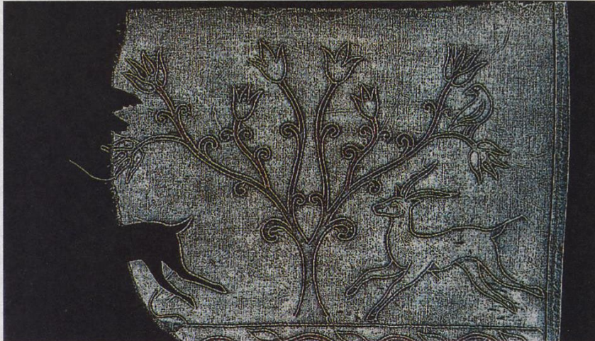
Kati Thamo's Escape by night .

We are invited to invent a narrative for which we have been provided