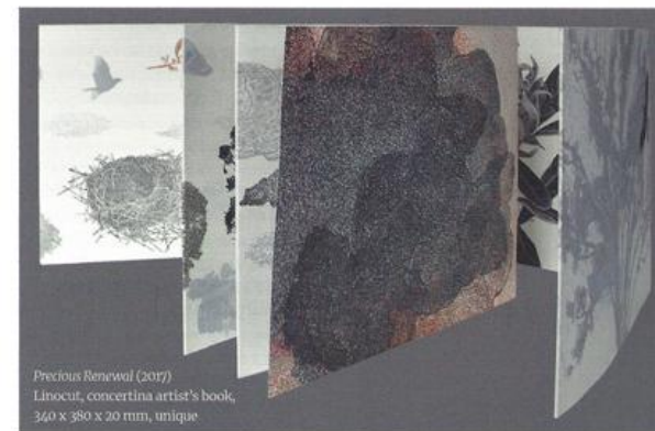
Precious Renewal (2017) Linocut, concertina artist's book, 340 x 380 x 20 mm, unique

The Wilderness Society reports that Australia is one of the worst of the developed countries in the world for broad scale deforestation – killing tens of millions of native animals (including threatened species) and wiping out endangered forest and woodlands. In The Fallen , fire and deforestation by men belong to the same category. But in other prints just trees fly, their trunks axed, as in the large print Against All Odds .