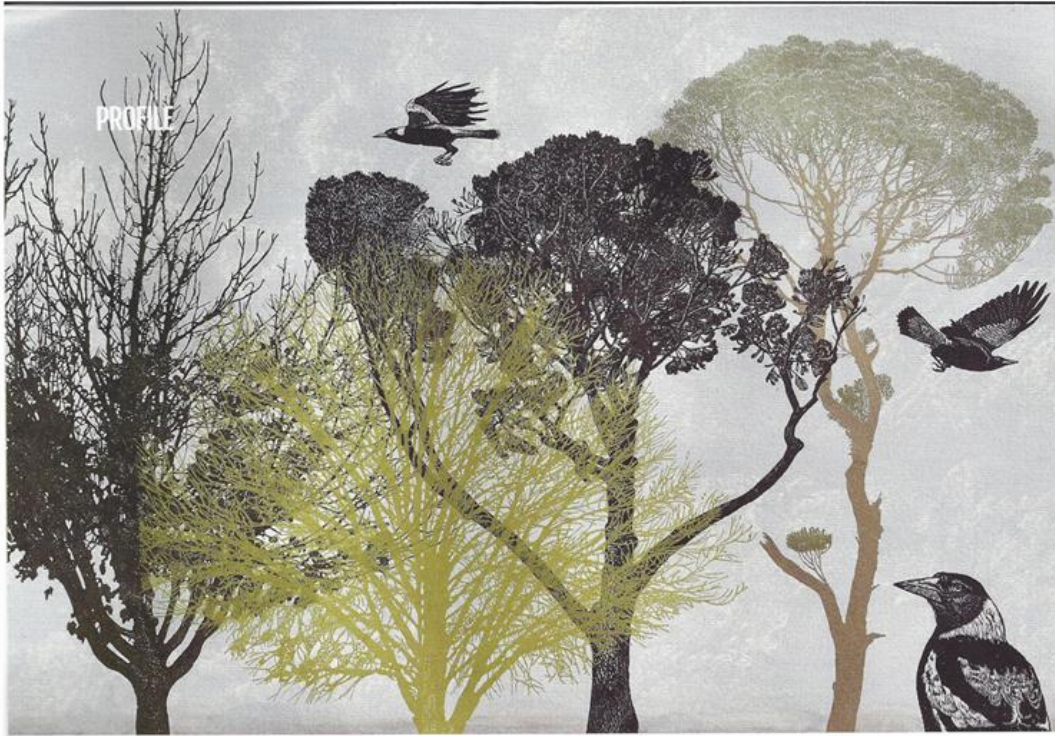
Covenant (2019) Linocut and woodcut, 1080 x 785 mm, unique