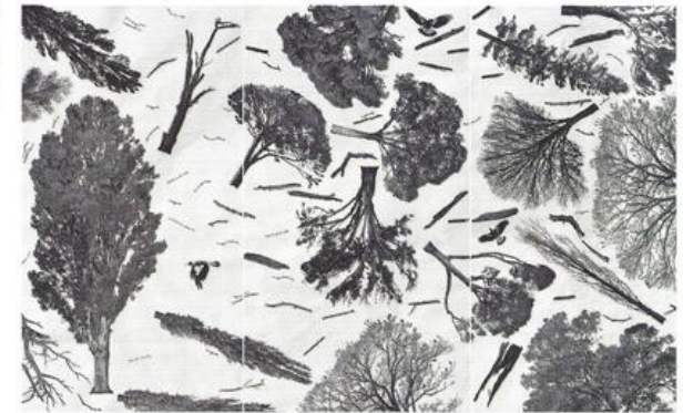
Above Against All Odds (2018) Linocut, 1440 x 2250 mm, unique

This brings us back to her interest to understand not only the moment of destruction, but also the time before and after. At the 2019 Sydney Paper Contemporary Art Fair the Australian Galleries invited her to present a solo exhibition of her unique state linocuts. Here she presented a series of prints under the title Divided World , where she explores the impact of fire on flora and fauna. It became a collection of prints of hope. The birds that in earlier prints flew away in panic are now exploring their new bare habitat.