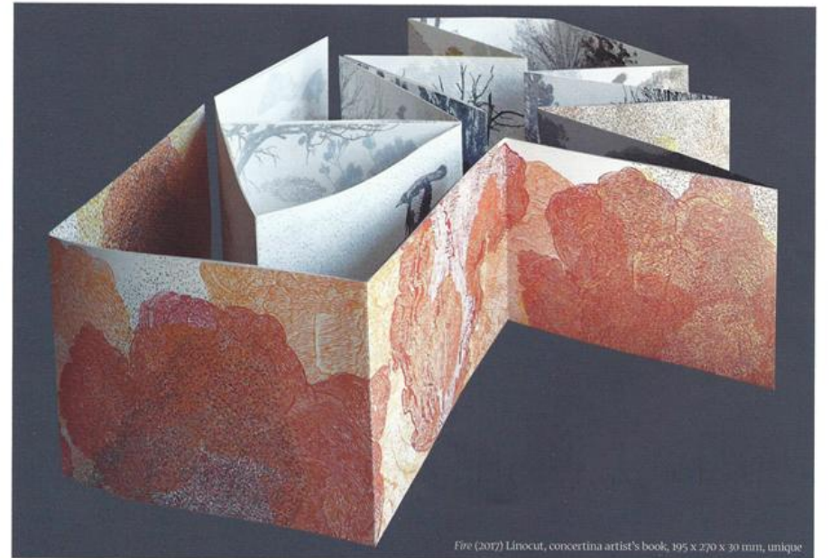
Fire (2017) Linocut, concertina artist's book, 195 x 270 x 30 mm, unique

pages of bare trees, interlinked with white pages with pieces of burned wood. That day, within 12 hours, 180 separate fires destroyed large parts of Southern Australia. The fires became the deadliest in Australian history until the Black Saturday bushfires of 7 February 2009, in which 450,000 hectares burned, 173 people died and it is estimated that more than 1 million wild and domestic animals were killed. The book she created to commemorate the tenth anniversary of this fire is made with white and black images on a grey background. It starts with the words: arson/environmental terrorism. It is kept, in a black presentation box with a simple red ribbon as a hinge on the book.