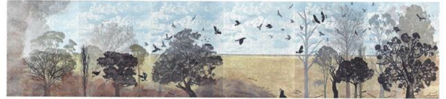
Portent (2018) Linocut, 1090 x 4770 mm, unique

In 2017, Fogwell started to contemplate another loss: the devastation of natural and unnatural disaster through fire or the hand of mankind. From the broader environment her vision focussed on the immediate neighbourhood, as a sample of global concerns. It was here, in 2003, that the Canberra bush fires raged and burned terrible memories into the minds of the locals. Australia is prone to bushfires and according to the Australian Institute of Criminology 50% are suspiciously or deliberately lit and arsonists are responsible for up to 30,000 bushfires yearly.