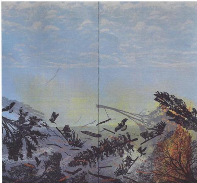
The Fallen (2019) Linocut and woodcut on hanji paper, 1450 x 1500 mm, unique

of things to come is visible in the form of the growing dust clouds of loose topsoil, which are sometimes seen the day before a bushfire.