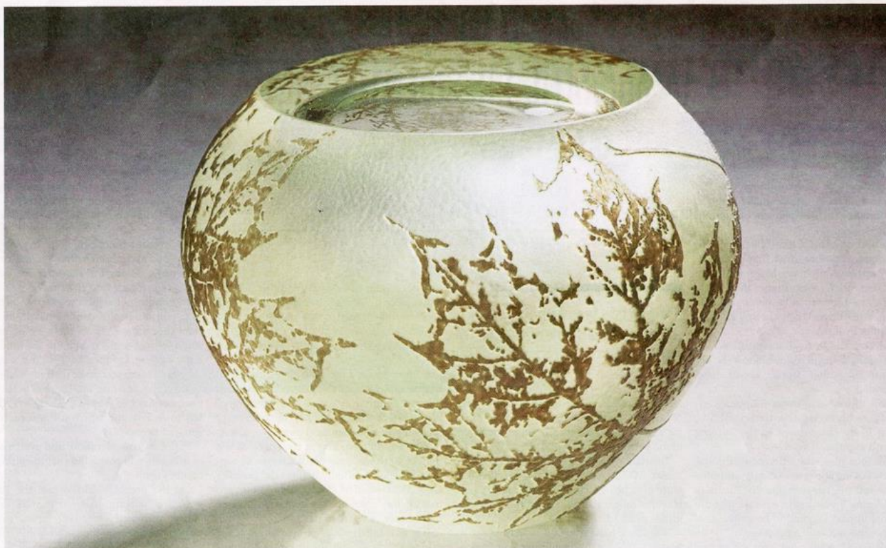
Nicole Ayliffe, Optical landscape Autumn leaf 1 in Seasonal landscapes.