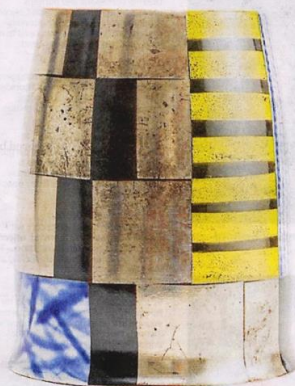
Kevin White's porcelain vessel, 22 x 18.5 x 18.5cm.

This is a clever and highly successful work that succeeds on many levels: as a decorative design, as a political comment, and as a commemorative historical record in an age-old ceramic tradition, all of which would make it an ideal work to be part of the national collection.